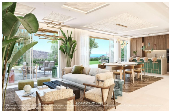
Common area, Cafe lounge

This computer-generated image is for illustrative purposes only and should be treated as a guide. Computer-generated images do not form part of any contract or warranty. The developer reserves the right to change the design shown in this image.