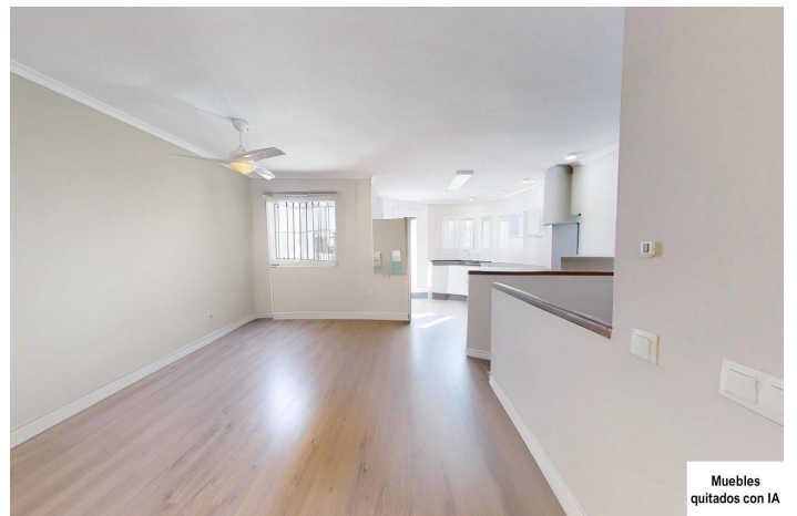
Muebles quitados con IA