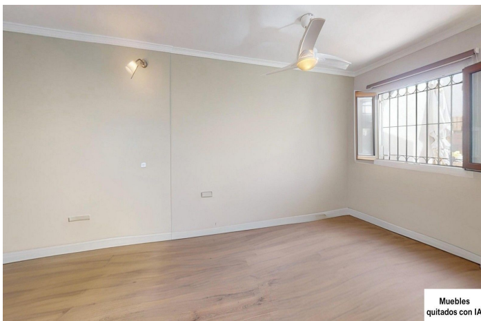
Muebles quitados con IA