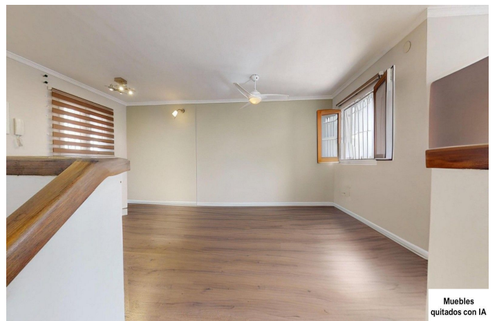
Muebles quitados con IA