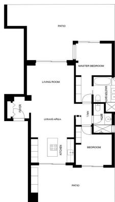
SIZES AND DIMENSIONS ARE APPROXIMATE, ACTUAL MAY VARY.