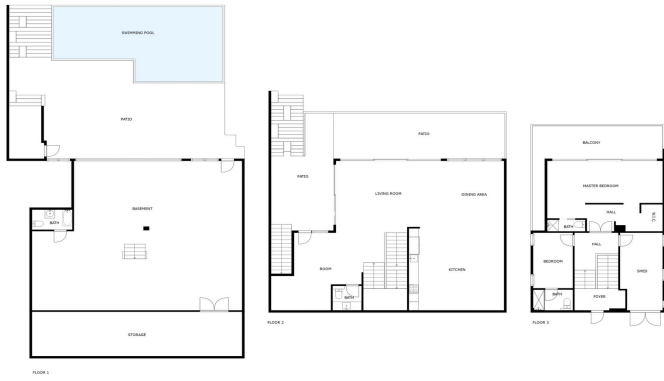
SIZES ARE APPROXIMATE, ACTUAL MAY VARY.